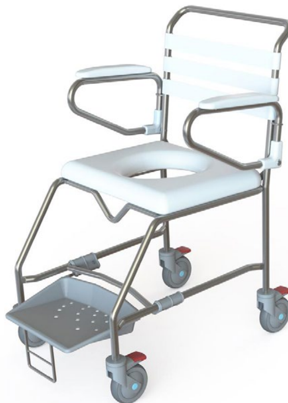
Example of a transit / attendant propelled commode with sliding footplate